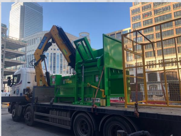
Images of compactor at 1 Bank Street

PPR is in the final stages of the development and hoping to handover the project by summer 2019.