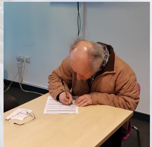
Images from Sheppard's Bush Library Open Day